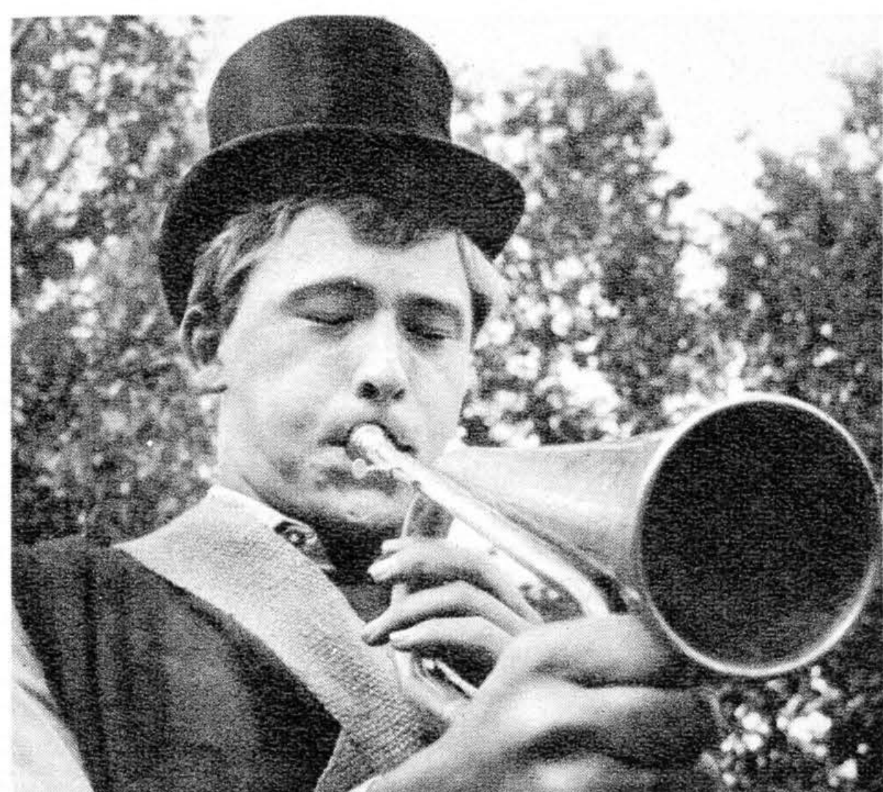
BUGLE HERALDS KING'S ARRIVAL