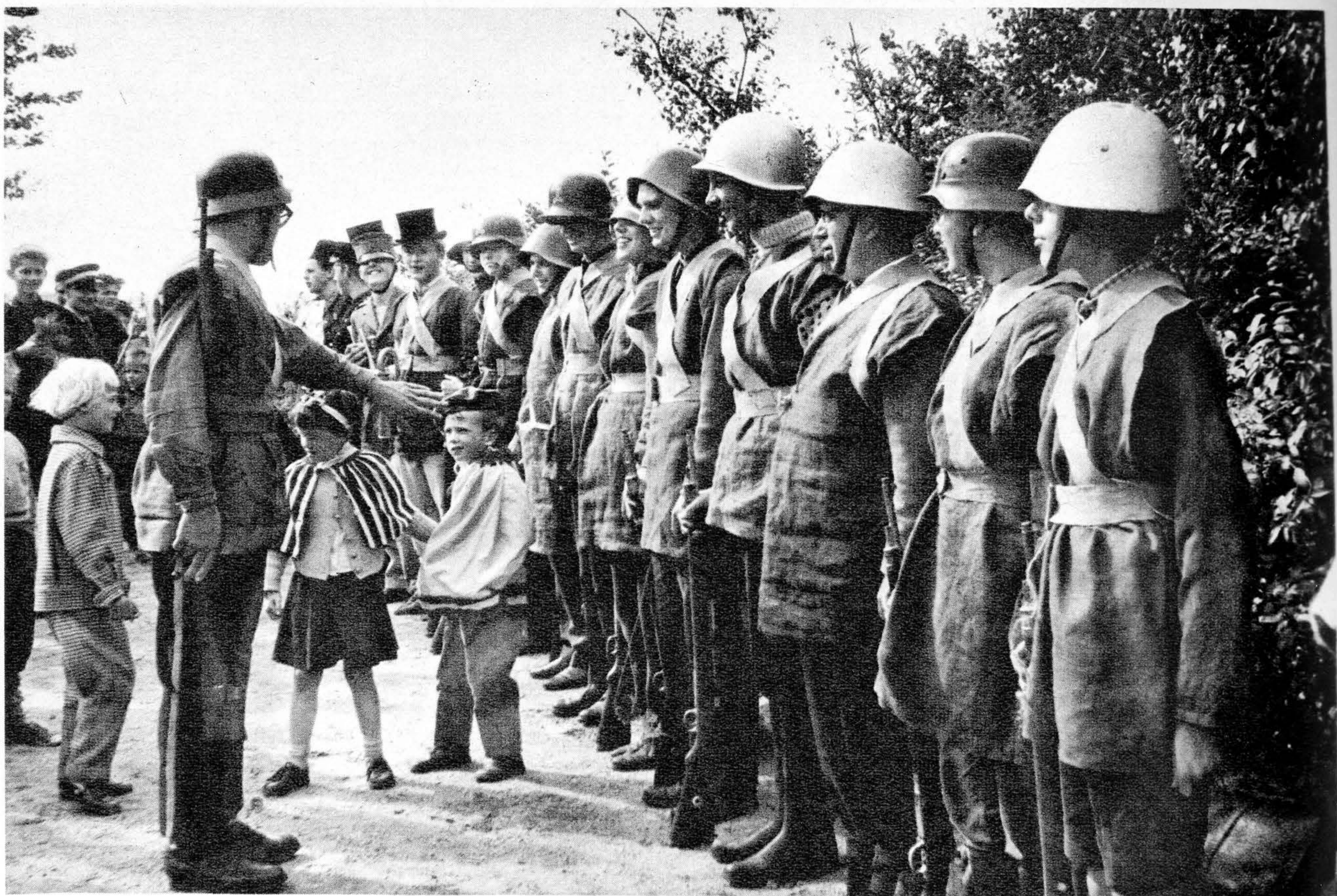
CHILDREN GET INTO THE ACT AS ELLEORE'S ARMY LINES UP FOR INSPECTION BY KING LEO