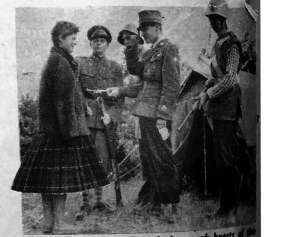
Tax has to be paid, and the rough hearts of the soldiers are not easy to melt – even if a young girl tries her most winning smile