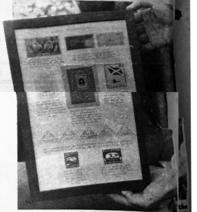
The historical background of 'Eileore' – such as the lion-hunting and the invasion in 944 A.D., by the Irish monks, etc. – can be studied on these stamps. Top left, the two kings – King Erik the Long and King Leo – are pictured together. The battle-stamp are in two colours and are used a great deal. Bottom left, is the airmail-stamp picturing a flying goose – the kingdom does not yet own an aeroplane!