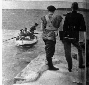
The navy of 'Eileore' puts to sea on a coastal patrol to ensure that there are no illegal immigrants

Everyone fears the tariff; customs duty must be paid on egg-and-sardine sandwiches and loose coat-buttons, for example. Relating to foreign politics, the government aims at good relations with both East and West. However, the army is in constant training, as the State believes in a policy of strength. The A-bomb has been renounced by the kingdom, because a