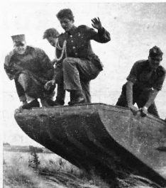
The troops are well-equipped and tough, and have to keep in training

The inhabitants of the kingdom of 'Elleore' are schoolboys from Copenhagen on vacation; the king and the ministers are their teachers. One of them, a teacher in History, believes that Irish monks landed on the island in 944 A.D.; because of this, the flag of the kingdom consists of a white cross on a red background. The only republican on the island tries to get a lion in the flag - but he is met with great opposition from the other islanders.