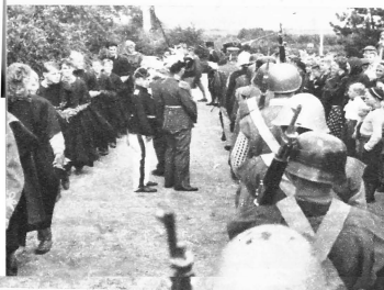
The population of the kingdom is small. On the local remembrance day, all inhabitants – including the clergy – form a parade, circling honoured members of the government

THE Kingdom of 'Eileore' is situated in Denmark, on a little island deep in the fiord of Roskilde – one of the many beautiful fiords in Denmark. You may not find this island on a map and, on a map of the world, it will only appear as a microscopic spot – because, being only 2,300 metres square, it seems quite insignificant.