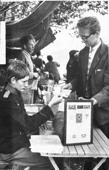
'Elleore' has its own finances, but you must pay a percentage to the treasury if you want your money changed in order to buy some of the rare stamps printed by the islanders